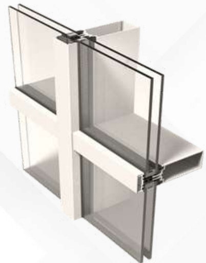
CW - 36

The minimal design offering reduced sightline, compared to other typical curtain Wall systems, only 36mm, the system's sleek design offers wide glazing areas, more natural light and enhanced comfort level.